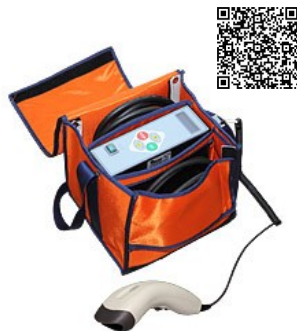
Elektra Light EF Machine