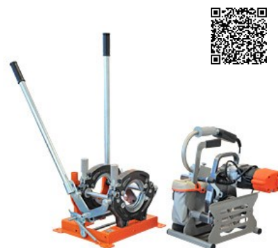
Delta 160 Machine